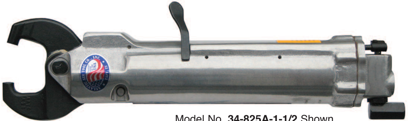
Model No. 34-825A-1-1/2 Shown